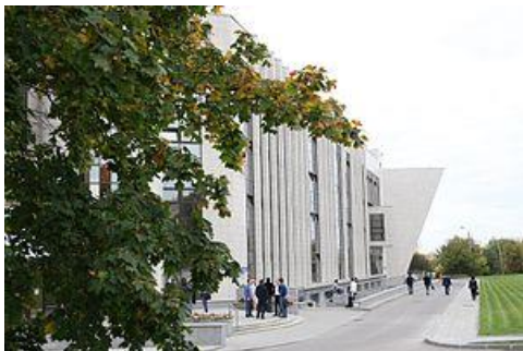
MGIMO Main Campus