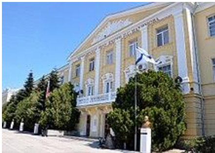
Sevastopol Nakhimov Higher Naval Institute

Even earlier they knew him as a pupil at the Sevastopol Nakhimov Naval School, and then as a cadet at the Frunze Leningrad Higher Naval School . Everything went logically and normally. As the son of a naval sailor, God himself ordered him to follow in his father's footsteps, and he attended until shortly before graduation when his eyesight suddenly failed. Had the authorities treated this misfortune back then, he was just a step away from becoming an officer--as if it were impossible to serve in the navy with glasses! Then there would not have been any Trianon, there would have been no need to develop super-complicated operations Cayman , Agronom , and Setun , and most importantly, there would have been no victims and there would have been no corpses.