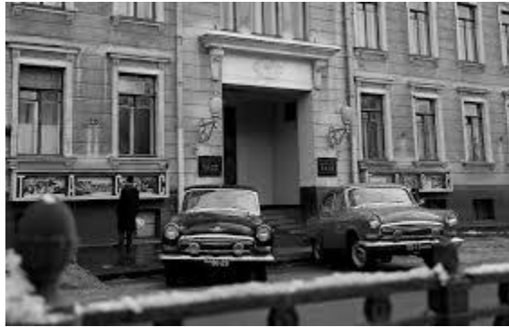
Two Volgas with the same license plate

“Through trial and error, we concluded that there could be three such parking spots – in the area of MGIMO near Culture Park, at the main entrance to the Central Park of Culture and Leisure and not far from the Foreign Ministry building. For each of these parking spots employees parked a specially made up Volga with Ogorodnik's license plate.