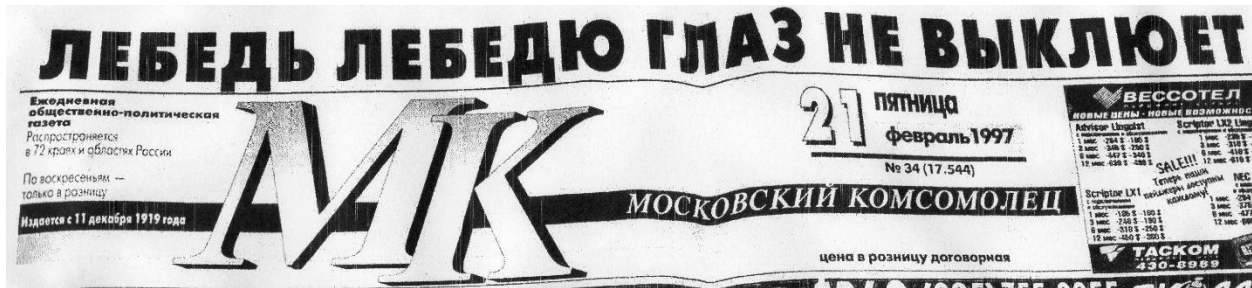
Moskovski Komsomolets 21 February 1997, Friday

“TASS is Authorized to Announce – 20 Years Later”