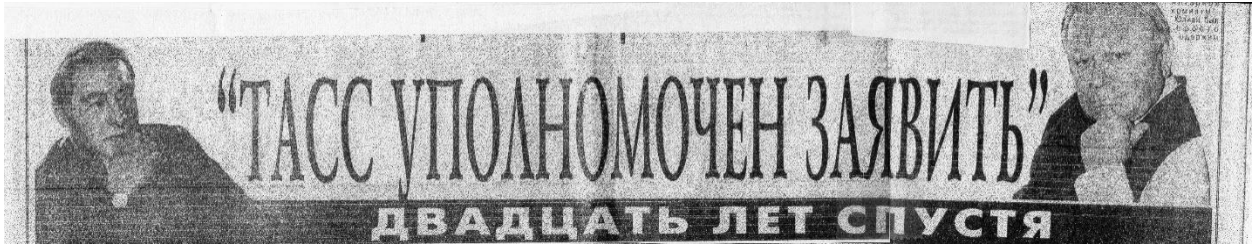
Photo of Alexander Izotov, movie producer

“ТАСС УПОЛНОМОЧЕН ЗАЯВИТЬ” Двадцать лет спустя